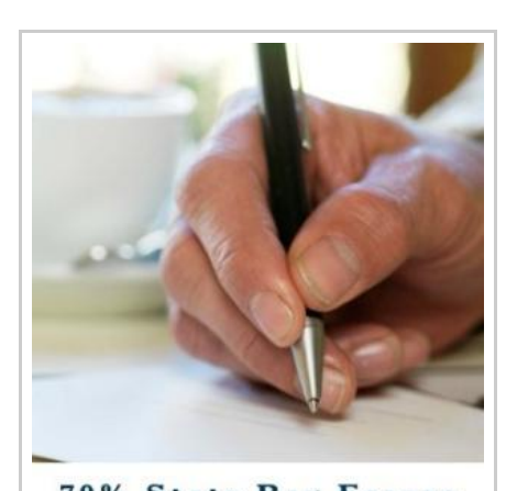
70% State Bar Essays Unblock Your Head And Pass Budget Law School For The Bar