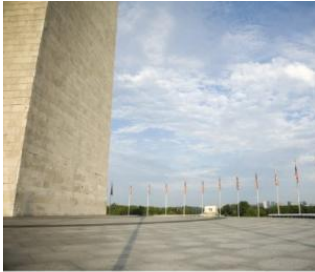
Fur seal Investigations, 1973: NWFC Processed Report